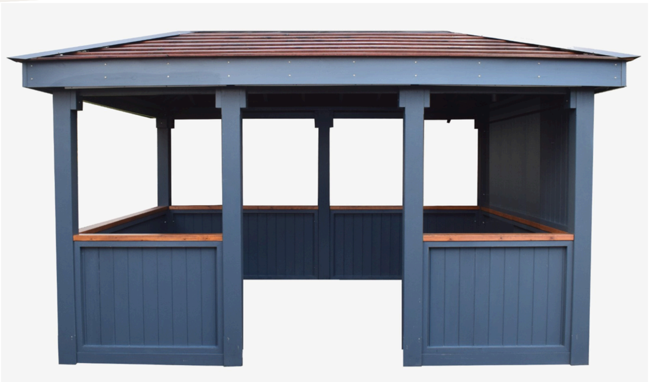
Pictured: Standard lounge with hipped roof and Velux rooflight upgrade

Solid timber floor in light or dark oak Morso 1010 stove package with flue and glass hearth Morso 4043 stove package with flue and glass hearth A stunning range of lounge furniture including L-shaped sofa, coffee table and side tables Solid, window and gable-end blind packages Brett Martin Cascade guttering Rooflight upgrade