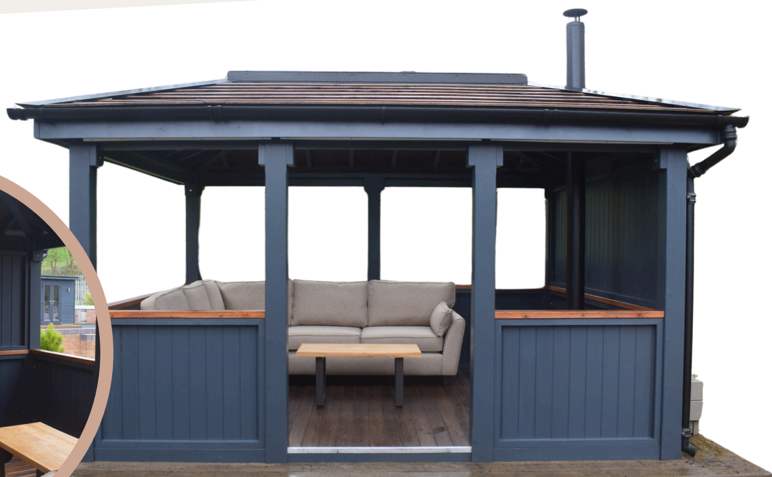
Pictured: Deluxe lounge package with hipped roof and Velux rooflight