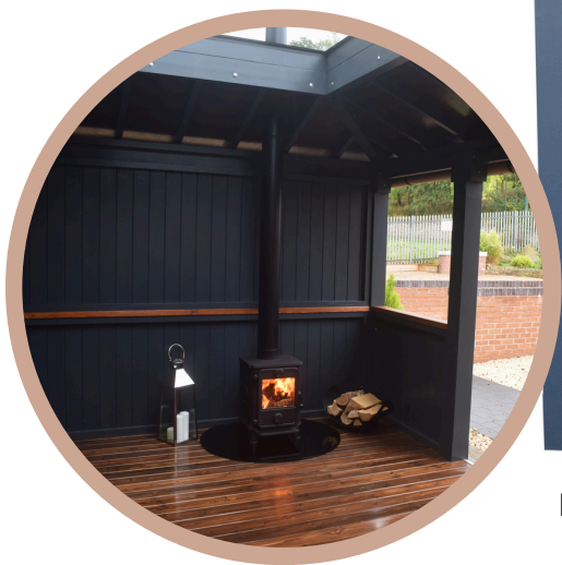
Pictured: Deluxe lounge package with hipped roof and Velux rooflight